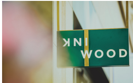
Inkwood 101, Bldg 24, 60 Panyu Rd

INSIDER TIP Lunch specials are quite a deal. I always go for the Philly-steak sandwich!