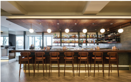
Highline 6/F, 282 Huaihai Zhong Rd

Get ready to make the most of your stay in this city of captivating contrasts. Whether you're savoring the city's futuristic skyline or exploring its intimate traditional lanes, we've got you covered with the places only locals know and love.